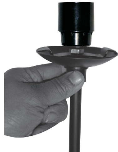
T X 1